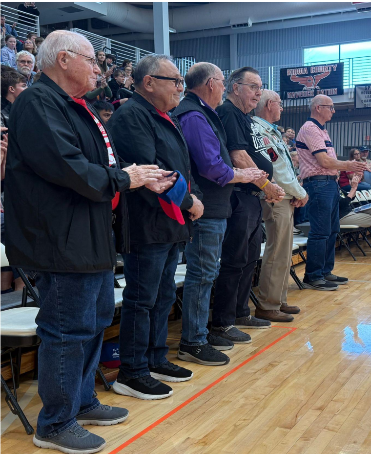
Left: Veterans being recognized during the program.