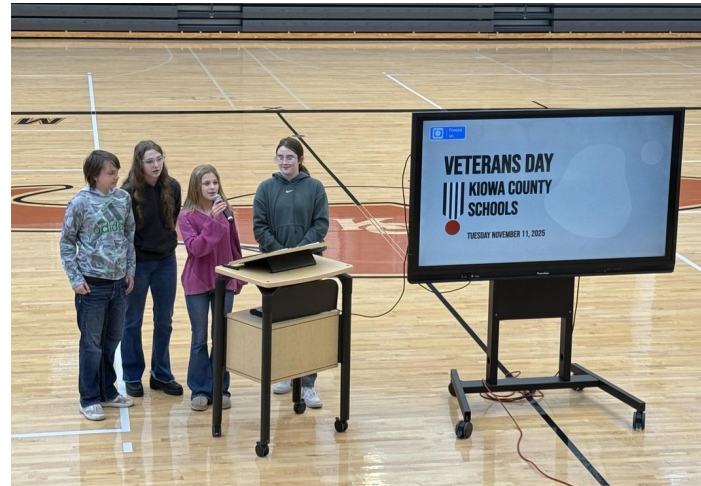
Above: KCJH Current Events class introducing themselves.