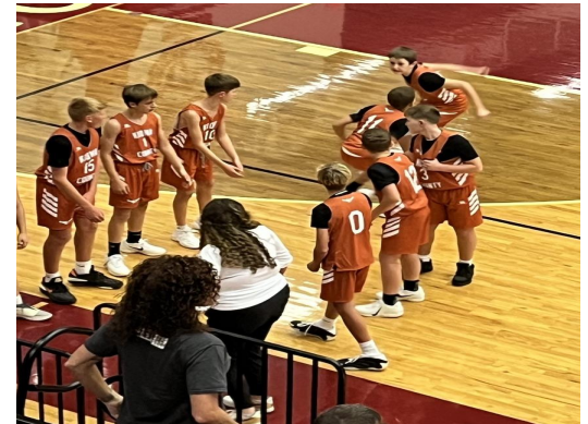
Bottom: Starters recognized before the game.